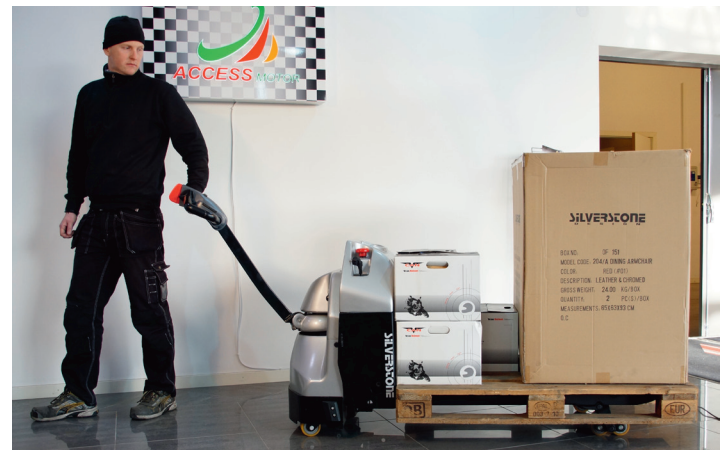
T20-18ET is a helping hand in the warehouse.